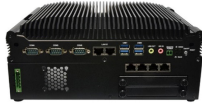
Figure 2. Lanner's LEC-2290

building hardware platforms on flexible x86 architectures, a wide range of available software allows for nearly limitless inter-connected solutions.