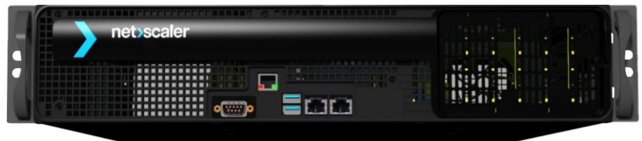
Figure 1: NetScaler MPX/NetScaler SDX hardware appliance

An enterprise-class solution, NetScaler application delivery and security software running on Intel platforms typically provides better performance than equivalent solutions built using custom-designed ASICs. 2 NetScaler MPX and NetScaler SDX ADCs are powered by Intel® Xeon® Scalable processors and Intel QuickAssist Technology (Intel QAT), enabling them to deliver highly performant applications and massive scaling of application traffic for on-premises deployments, including private clouds. Intel QAT accelerates cryptography and compression algorithms, while also reducing CPU cycles.