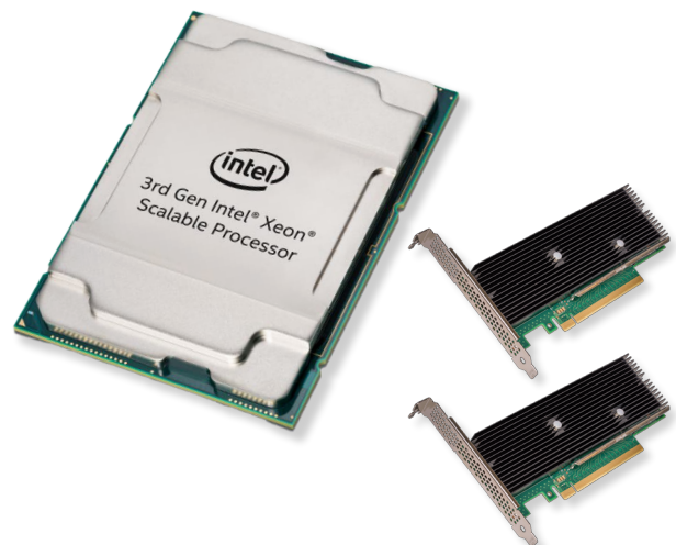
Figure 3: 3rd Gen Intel Xeon Scalable processors and Intel QAT accelerators

Intel Xeon Scalable processors provide computing power that reduces time to insights for the most intensive workloads. They offer a balanced architecture with built-in acceleration and advanced security capabilities, to deliver performance and power efficiency advantages for dynamic workloads.